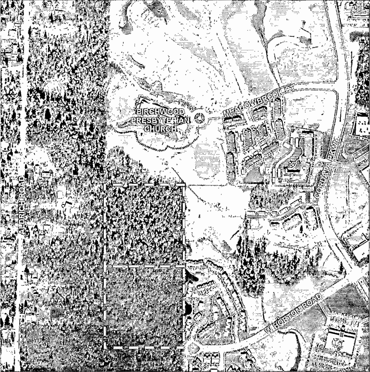
"CORDATA PARK" AERIAL SITE PLAN